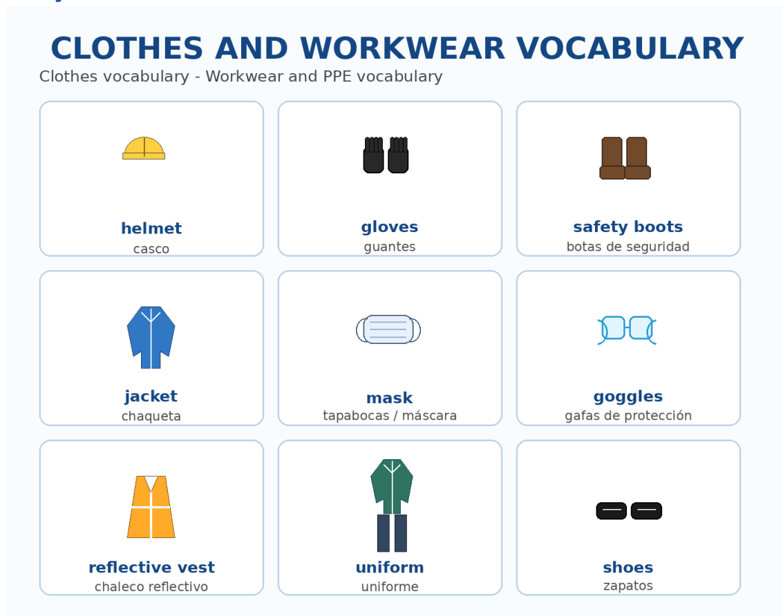
Imagen de apoyo: clothes vocabulary, workwear and PPE vocabulary.